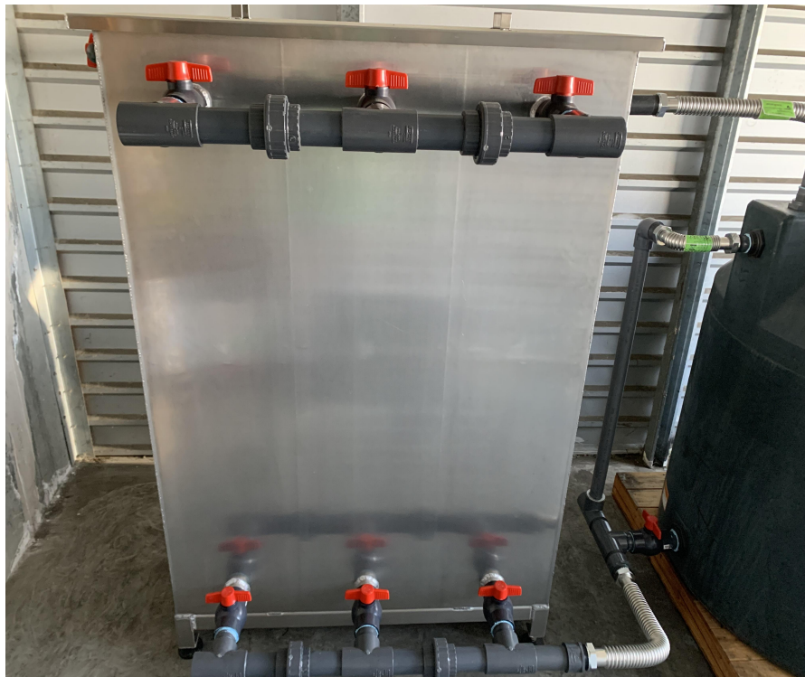
AGC-BS-240 Above Ground Clarifier