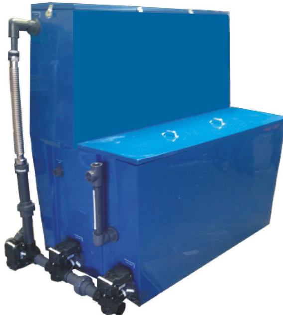
AGOS Shown with Optional ADF (Automatic Drain Flush Valves)