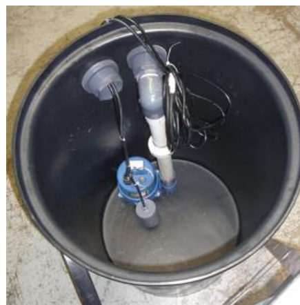
Sample Barrel and Pressurized Discharge to Sewer OPTION

Manufactured of all ASTM Certified Materials and UL Approved Electrical Components Where Applicable Visit our web site to find out more www.watercycle-solutions.com