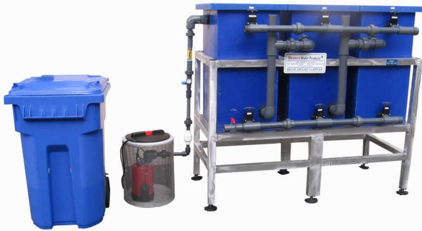
SDS-005 and AGC-BS-150 Sewer Discharge System

What is a Clarifier or Sewer Discharge/Pretreatment System?